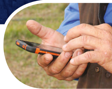
National Vendor Declarations are now available electronically (the eNVD)

The National Livestock Identification System (NLIS) is Australia's system for the identification and traceability of cattle, sheep and goats. The NLIS combines three elements to enable the lifetime traceability of animals: a visual or electronic ear tag, a Property Identification Code (PIC) for identification of physical location, and an online database to store and correlate the data. Visit www.integritysystems.com.au/nlis