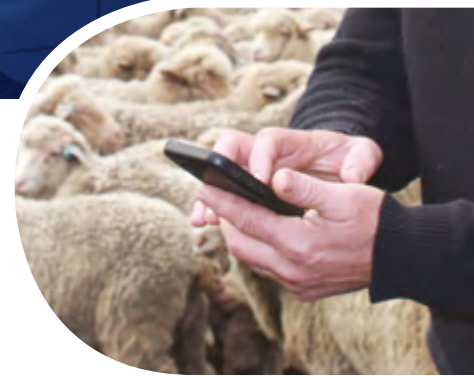
National Vendor Declarations are now available electronically (the eNVD).

The National Livestock Identification System (NLIS) is Australia's system for the identification and traceability of cattle, sheep and goats. The NLIS combines three elements to enable the lifetime traceability of animals: a visual or electronic ear tag, a Property Identification Code (PIC) for identification of physical location, and online database to store and correlate the data. Visit www.nlis.com.au